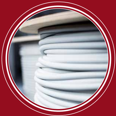
CABLES & WIRES